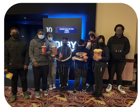
Winter break fieldtrip to the movie theater “Spider - man no way home”