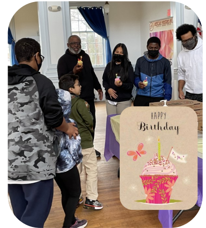
Monthly birthday celebration