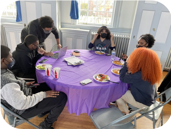
Break time for a snack