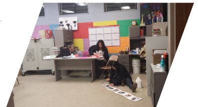
High School Volunteers