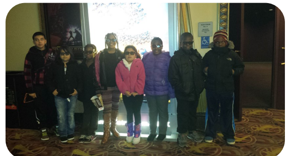
Restore Kids at the Movies