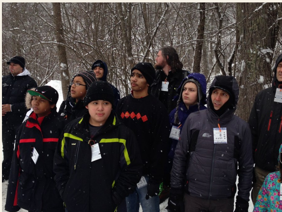
Middle School Members on a Winter Retreat

What does it mean to love somebody? Is it what we see in the movies or the popular music videos? Let's talk about what real love means. Love is not only expressed in words but by our deeds. By that I mean, you can tell your par-