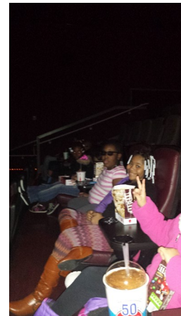
A Day at the Movies

IF YOU MUST LOVE YOUR NEIGHBOR AS YOURSELF, IT IS AT LEAST AS FAIR TO LOVE YOURSELF AS YOUR NEIGH- BOR