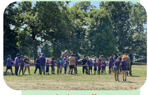
Junior staff High school and college students running outdoors teambuilding activities

Restore's ACE "Art, Community, Enrichment" Summer Camp has accomplished yet another fantastic summer for children and youth with the cooperation of Elizabethport Presbyterian Center, Incredible Days Group, Institute of Music for Children, Union County Human Services Department, City of Elizabeth, Parents, Staff, and the valuable support of its Donors.