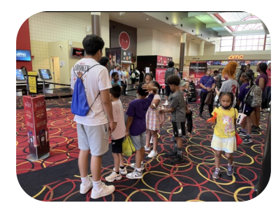
2 Elementary groups (6 to 9 years old)