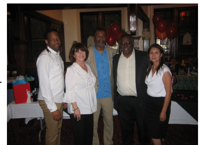
Staff and Board Members of Restore Ministries