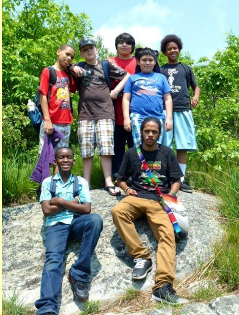
Restore participants hiking at Stokes State Forest

Poverty is muck-like; its suction thwarts