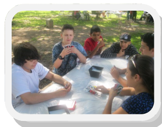
Younger kids with Conoco Phillips volunteers at the barbeque at Mattano Park.