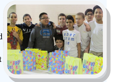
Restore kids at Easter Egg Hunt