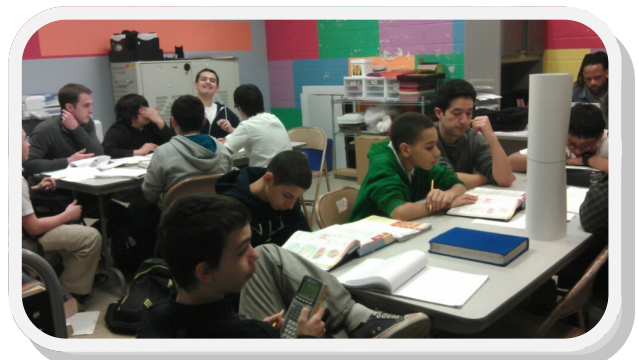
Working diligently in the homework center