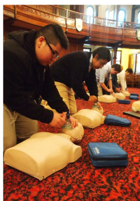
Leader students and staff during a recent CPR and AED training.