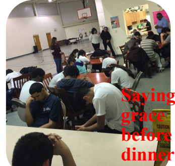
Saying grace before dinner

Phillips66 has become a major stakeholder at Restore. They provide a yearly donation for the Homework Center and we receive an additional monetary donation for the volunteering time of each Phillips66 tutor. In addition to the February 15th tour, Phillips66 volunteers support our children and teenagers in many ways throughout the school year. They come to tutor, they take the lead in Restore's annual Science Fair and they have become a part of the Restore family. After many of the kids finish with their homework, a Phillips66 volunteer practices time tables and vocabulary words with them. SAT tutoring with Phillip66 tutors will begin after the Spring Break. But what the children and teenagers like most is that Phillips66 volun-