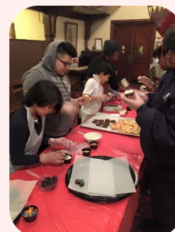
February Cooking Class