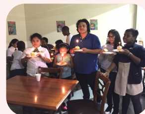
Monthly birthdays celebration