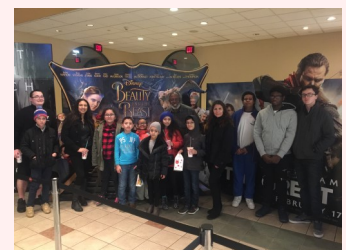
Black History Month field trip to the movies, Hidden Figures