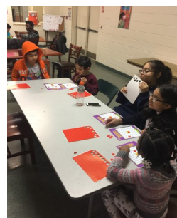
Children practicing for vocabulary challenge

Valentine’s Dinner on February 13. Camp Johnsonburg will share about summer camping and lead us in the evening activities. Parents, family members and you are invited to join us. Our first Vocabulary Challenge will be in